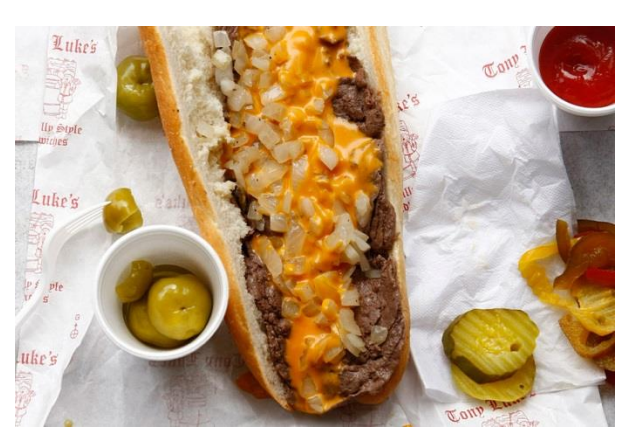
PHILLY CHEESE STEAK