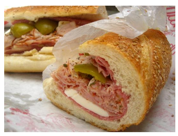
PHILLY ITALIAN HOAGIE