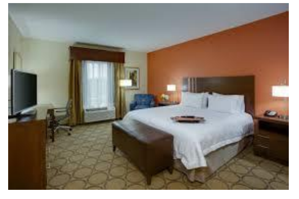
HAMPTON INN & SUITES