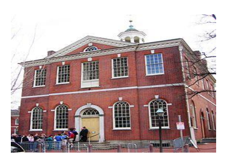
OLD CITY HALL