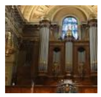
BASILLICA CATHEDRAL OF SAINTS PETER & PAUL