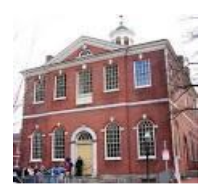
OLD CITY HALL