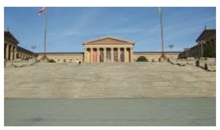
ROCKY'S STEPS (PHILADELPHIA ART MUSIUM)